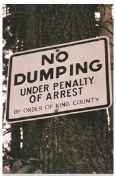
A "No Dumping" sign discourages illegal dumping by threatening arrest

Illegally dumping wastes down storm drains and creating illegal dumps can impair water quality. Runoff from dumpsites containing chemicals can contaminate wells and surface water used as sources of drinking water. Substances disposed of directly into storm drains can also lead to water quality impairment. In systems that flow directly to water bodies, those illegally disposed-of substances are