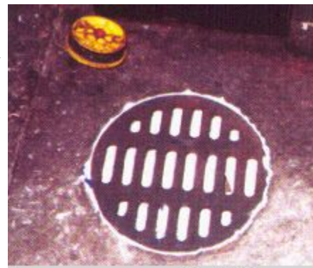
A common source of pollution from businesses is a floor drain that is improperly connected to a storm drain (Source: Petro-Marine Company, Inc., no date)

This management practice involves the identification and elimination of illegal or inappropriate connections of industrial and business wastewater sources to the storm drain system. Illicit connection detection and elimination programs attempt to prevent contamination of ground and surface water supplies by regulation, inspection, and removal of these connections. Any industrial discharge not composed entirely of storm water that is conveyed to the storm drainage system or a water body is considered to be an illicit discharge. These discharges may contain a variety of pollutants that can affect both public safety and the aquatic environment.