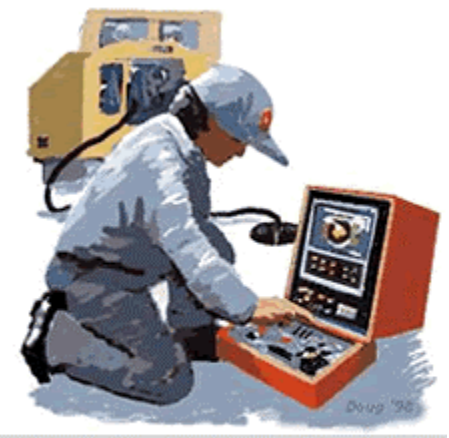
One of the ways to identify illicit connections is by inspecting storm drain system using video equipment

From 1987 to 1998, Wayne County, Michigan, investigated 3,851 businesses and industries for illicit connections to the county's storm sewer system. Of those investigated, about 8 percent had illicit connections, and where one illicit connection was found, there was an average of 2.4 improper