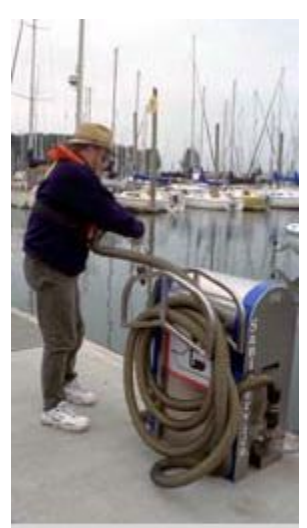
Many marinas provide pumpout stations for safe disposal of bilge

The proper disposal of recreational waste is necessary to avoid the impacts that these activities and their associated developments (i.e., marinas and campgrounds) can have on aquatic environments. Marina and recreational boat sewage can have substantial impact on water quality by introducing bacteria, nutrients, and hazardous chemicals into waterways. It has been reported that a single overboard discharge of human waste can be detected in up to a 1-square-mile area of shallow