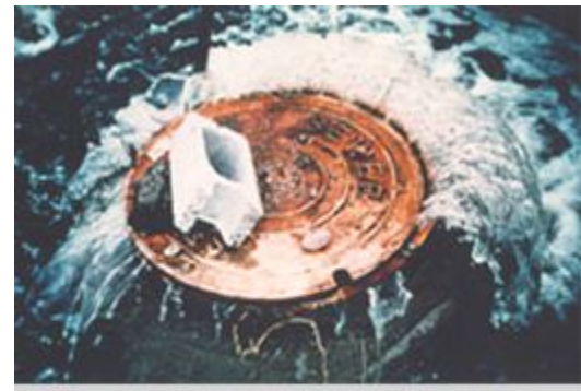
During large storm events sanitary sewers receive storm water runoff in addition to wastewater, causing them to overflow (Source: USEPA, 2000)

This fact sheet deals with detecting and correcting sanitary sewer overflows in a community. Sanitary sewer overflows (SSOs) involve the release of raw sewage from a separate sanitary sewer system prior to reaching a treatment facility. The raw sewage from these overflows contains bacteria and nutrients that affect both human and environmental health. These overflows occur when the flow into the system exceeds the design capacity of the conveyance system, resulting in discharges into basements, streets, and streams. A common SSO is overflowing sewage manholes that send untreated sewage into a stream. While SSOs can