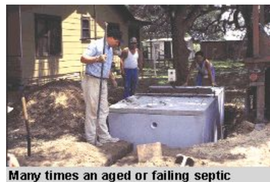
Many times an aged or failing septic system requires tank replacement

Septic systems provide a means of treating household waste in those areas that do not have access to public sewers or where sewering is not feasible. For example, more than 80 percent of the land developed in the state of Maryland in the last decade has been outside the sewer and water "envelope" (MOP, 1991). Currently, it is estimated that 25 percent of the population of the United States rely on onsite wastewater systems to treat and dispose of their household waste. Of that number, about 95 percent of the disposal systems are septic tank systems. The goal of this fact sheet is to prevent new